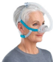
Optional over-the-head connection.

Ask your healthcare provider about F&P Nova Nasal.